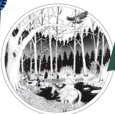
"Flight To A Distant Wilderness" TULSA INDIAN ART MARKET 1st. Place - Graphics FIVE CIVILIZED TRIBES MUSEUM Honorable Mention - Graphics