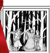
"Still Not Out Of The Woods" FIVE CIVILIZED TRIBES MUSEUM 2nd. Place - Miniature