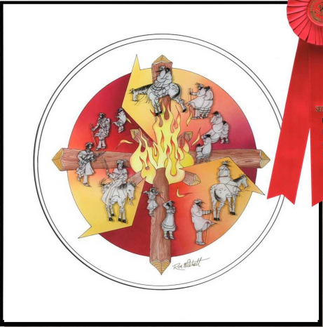
"From The Sacred Fire" FIVE CIVILIZED TRIBES MUSEUM 2nd. Place - Graphics